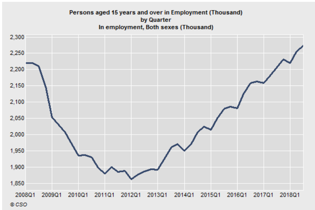
Figure 1 Numbers Employed in Ireland by Quarter 2008-2018.

Source and notes: Constructed from www.cso.ie data as downloaded 20190201. Employment is a good measure of the Irish economic performance: Given the high level FDI in Ireland results in problems with usual GDP measure that is generally used for international comparisons. Given the openness of the Irish Labour market, and discouragement of labour force participation as a downturn persists, unemployment figures are not as good an indicator as the employment numbers shown above. Since the labour market tends to lag the overall economy the period starts in 2008.