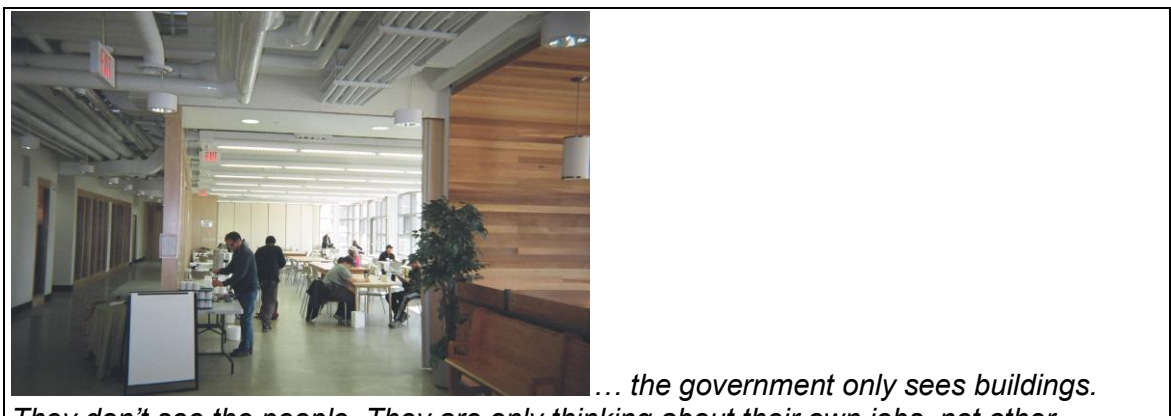
They don't see the people. They are only thinking about their own jobs, not other people's jobs – they don't have any work [for us]. When the city changed the structure of Regent Park, it put new drop-ins. (Q2 003)

income their families have. [...] Over 75 children were deprived of the program due to lack of funds. (Q2 A008)