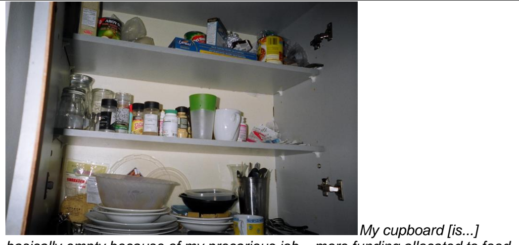
basically empty because of my precarious job... more funding allocated to food banks, increase in work wages and more work opportunities – these are the resources that I need to get out of this situation. (Q1 A007)

Another participant referring to a photo of a sparsely stocked cupboard comments,