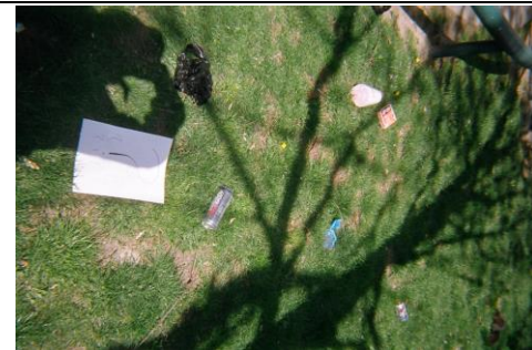
left here by homeless (who do not have a job) that go over there to smoke and drink. (Q1 A 004)

While physical and mental health issues can be a concern for those precariously employed, social health is also identified as a concern that effects public space.